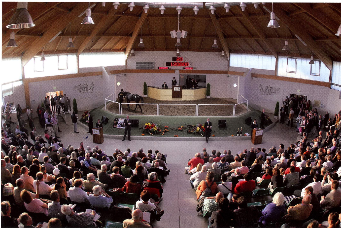
Gestüt Park Wiedingen sold recent Derby Italiano winner Feuerblitz for just €3,000 in the BBAG sales ring in 2010

Little surprise then, that more and more international agents, trainers and owners will make their way to the BBAG sales complex for >>